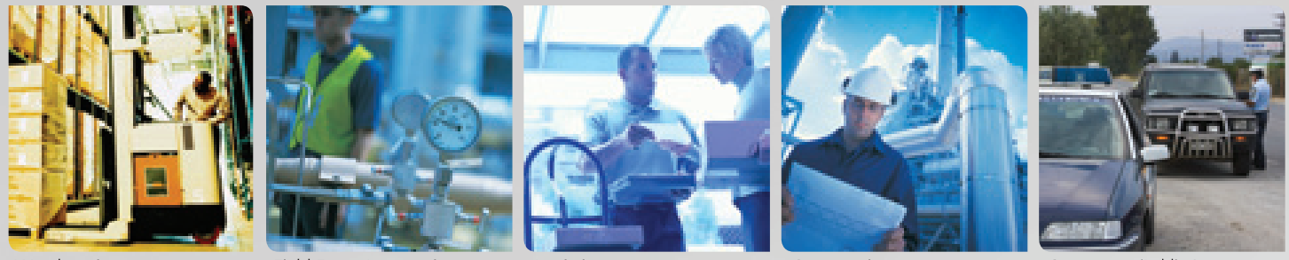
Warehousing Field Force Automation Logistics Construction Government/Public Sector